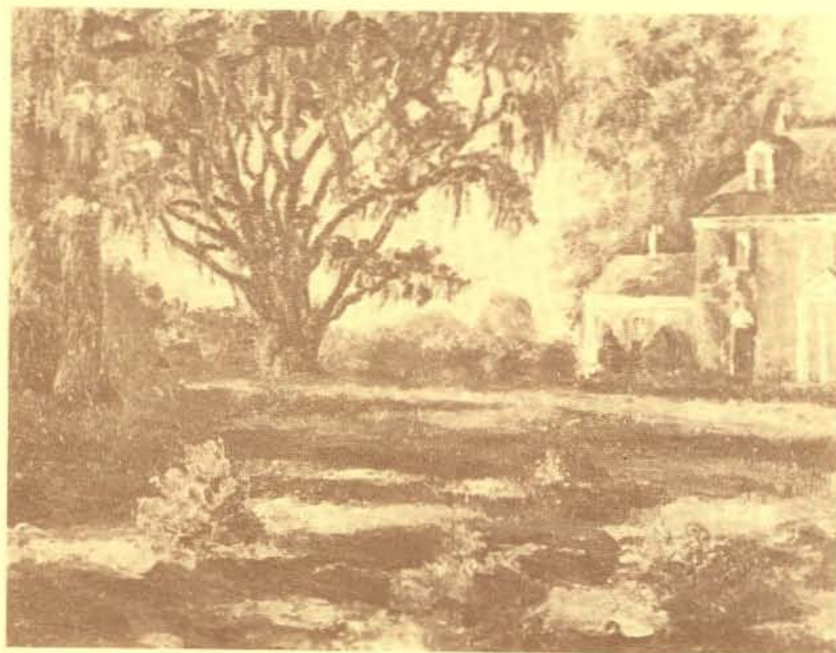
Clarendon House, 1931