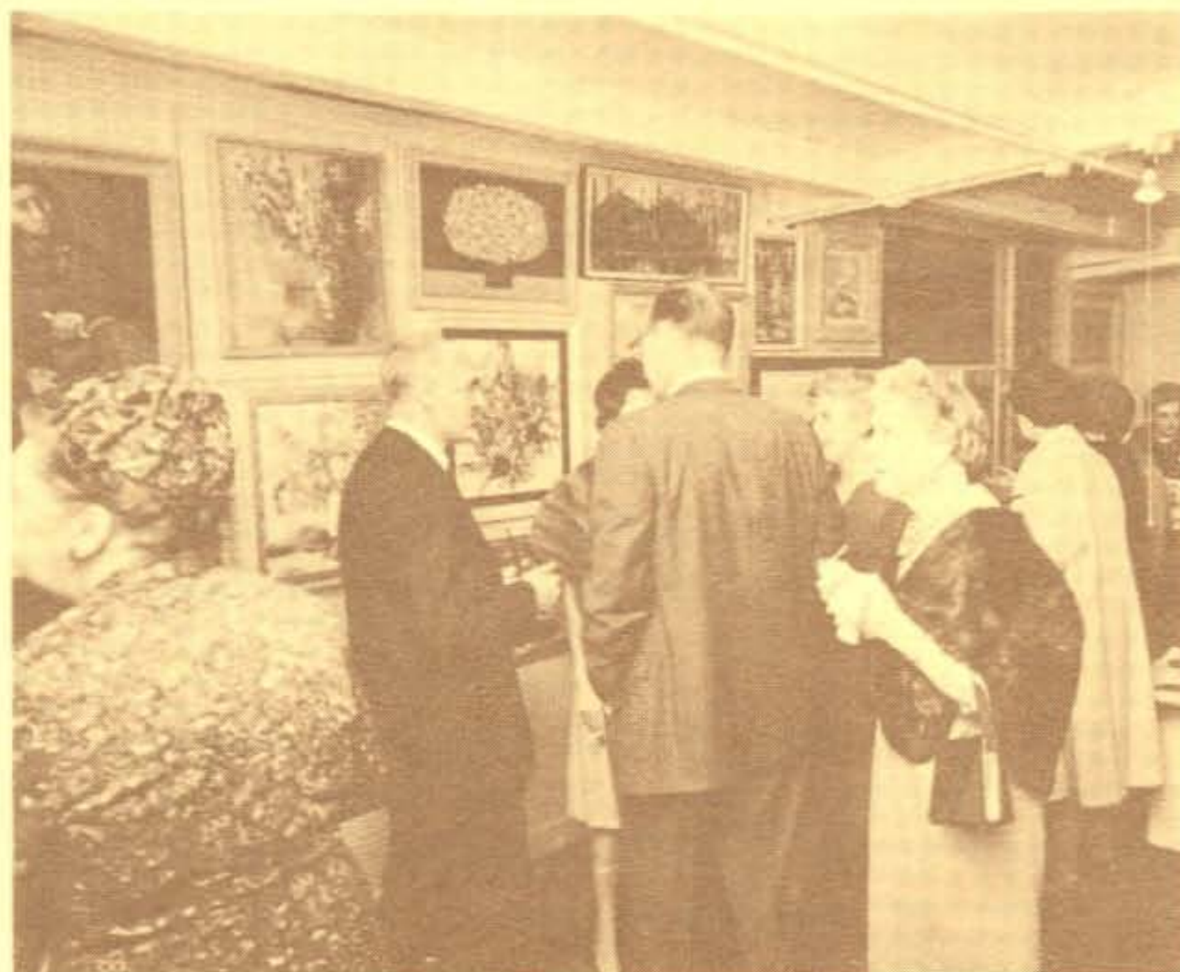
Gallery members and their guests at the January opening view paintings in the stock gallery recently opened on the first floor at St. John's.

Non-Profit Org. U. S. Postage PAID Wilmington, N. C. Permit 326